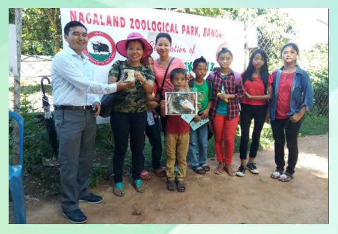
Figure 2: Wildlife photo mugs and photo frames distributed by Nagaland Zoological Park, Rangapahar, Dimapur.

the contamination of the food-chain by the chemical - diclofenac, which is lethal to them when they consume animal carcasses treated with the chemical. The role of the humble bee in pollination and in the propagation of plants was highlighted. Experts from Blyth Tragopan Conservation and Breed-