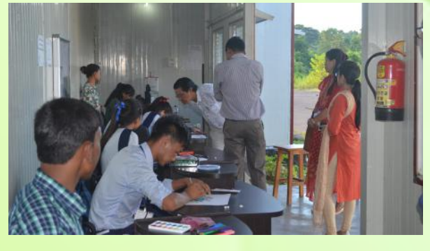
Figure 28: Painting competition at College of Veterinary Science and Animal Husbandry, Jalukie, Nagaland

banners and flex with profound messages towards Wildlife Conservation were erected.