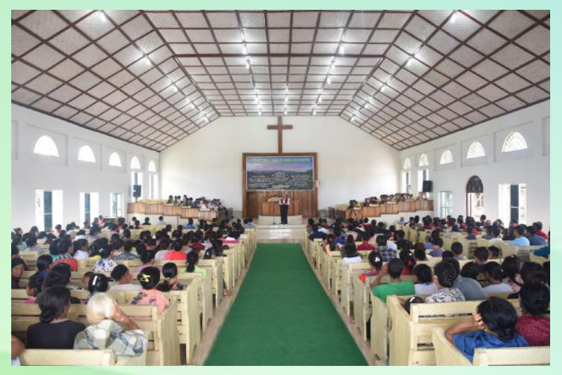
Figure 19: Audience listening enthusiastically to the Chief Guest at Yaongyimchen village, Longleng

Wildlife Sunday Worship was observed on 8th Oct 2017 at Longleng Town Baptist Church inculcating a spirit of conservation amongst the participants. Shri. P. Roy Thomas, IFS Jt Figure 21: Shri Roy speech at Longleng