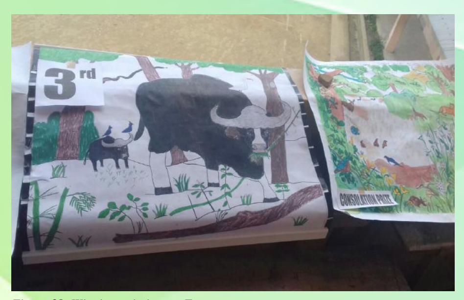
Figure 39: Winning paintings at Tuensang