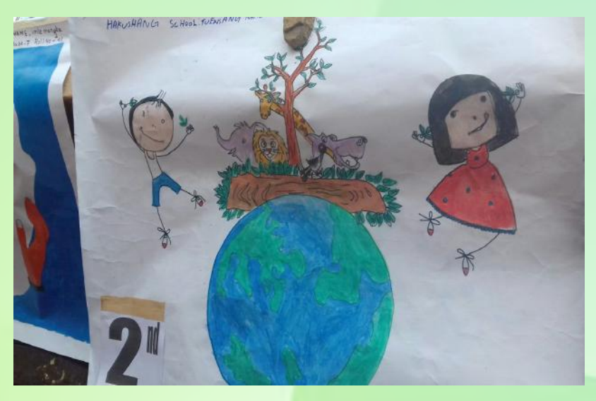
Figure 38: Winning paintings at Tuensang