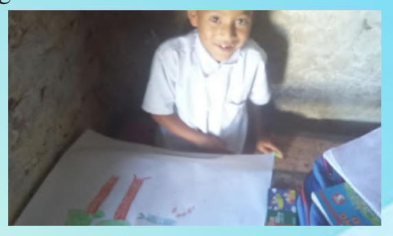
Figure 14: A happy kid after completing his painting at Government Primary School Nyengching, Longleng.

Wildlife Week 2017 was celebrated by the Department on 6th Oct 2017 by Government Middle School Trongar 'A' Eco Club and Government Primary School Nyengching, Longleng.