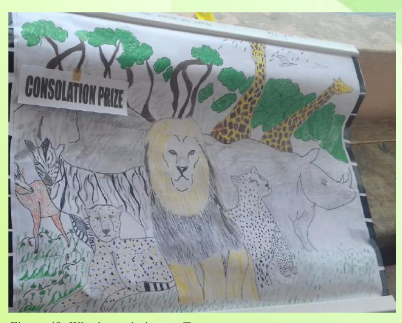
Figure 40: Winning paintings at Tuensang