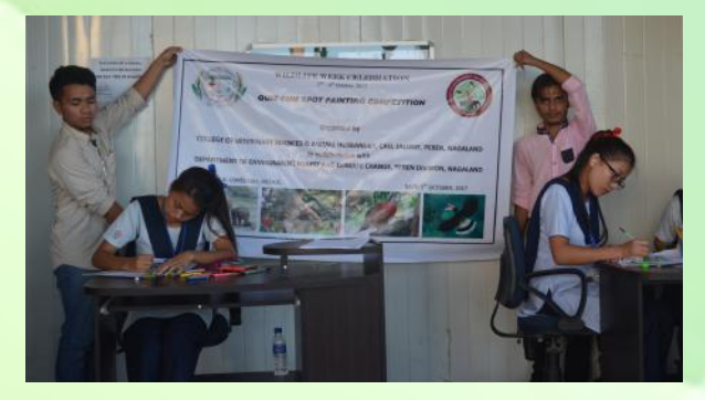
Figure 29: Painting competition at College of Veterinary Science and Animal Husbandry, Jalukie, Nagaland

Government offices, schools, and churches with the message of Wildlife conservation and had put up flex and banners in their campus with strong Wildlife message, altogether 39 flex and banners and locations were identified to