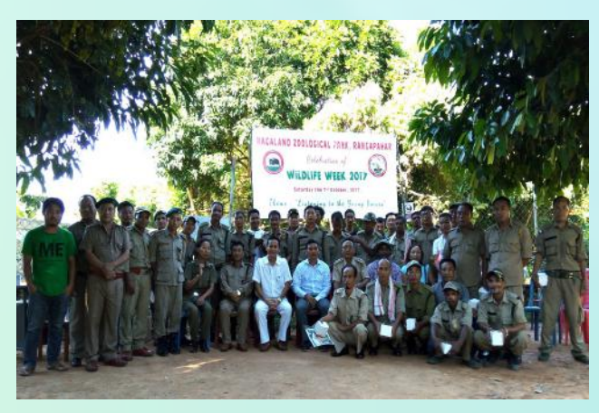
Figure 3: Token of gratitude and interaction of wildlife staff at Nagaland Zoological Park, Rangapahar, Dimapur

to all visitors and special interactions with the zoo staff marked the day. Wildlife photo mugs, photo frames with wildlife photos from the zoo were distributed to the visitors. Dedicated zoo staff were also felicitated. Wildlife Quiz for the staff was also conducted to mark the occasion. As a token of gratitude for their services in the zoo, all Animal Section staff comprising of - animal at-