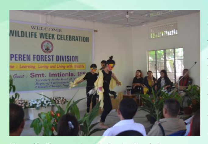
Figure 30: Choreography at Ao Baptist Church, Peren.

On 6th Oct 2017, an awareness programme was organised at Jalukie for public. The public were reminded to be aware of their calling for stewardship in wildlife conservation with a strong call – "Humans give your hands towards conservation, not to destroy them. If this world ceases to exist, then where is your future?". Life that should be viewed from cosmos-centric and not anthroposcentric perspective and not to reduce the kingdom of God just to soul saving and individual greed. A comparison between the creation as depicted in the bible and the Science of creation was made. The beautiful earth that we live here is God's blessing,we did not inherit it but borrowed from our children.