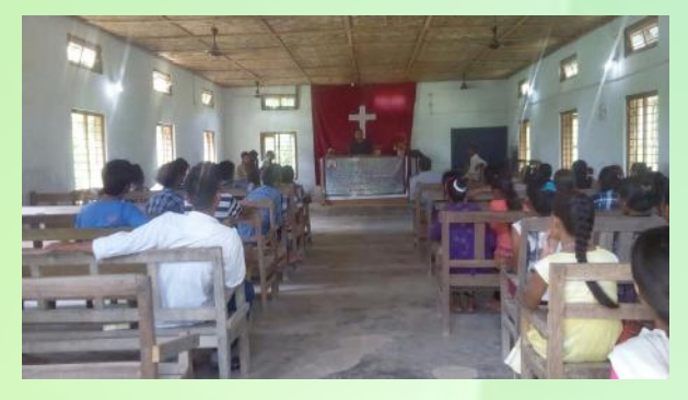
Figure 26: Department interacting with participants at Namthai Village Konyak Baptist Church, Mon

kinds of illegal destruction. A short speech was also delivered by field staff in local Konyak dialect