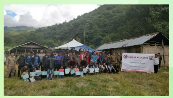
Figure 5: Children with certificates after painting and drawing competition at Likhimro Bridge campsite area, near Thanamir village, Kiphire.

The Department set up a camping site at Likhimro Bridge (near Thanamir village), Pungro subdivision, Kiphire on 1st