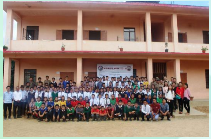
Figure 35: Participants from Hakushang School, Tuensang

The Department organized the celebration of wildlife week 2017 program under the theme "Wildlife and Nature" on 7th October 2017 at Hakushang School, Tuensang. The concept of all living organisms holding a place in the food chain was explained to the participants. Extinction of one species in food chain can threaten and alter the physical environment as well. The students were encouraged to reach out to influence and engaged their parents, neighbours and communities to promote awareness on wildlife conservation. Competition was held in three categories - painting, essay and quiz competition to spread awareness and create consciousness towards wildlife conservation and protection.