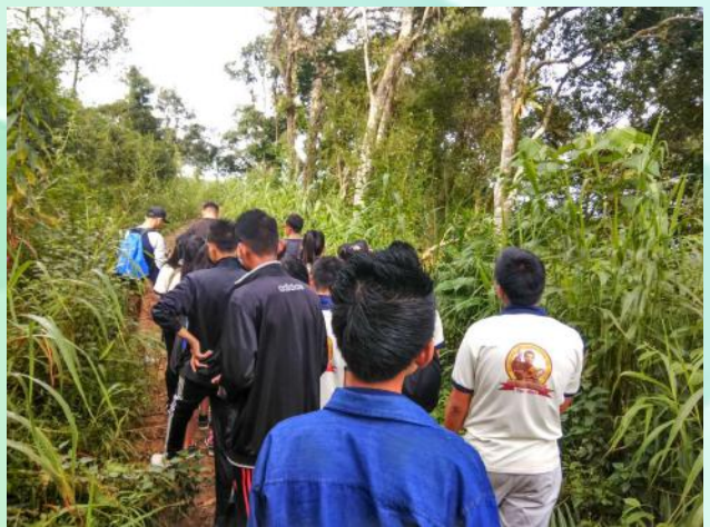
Figure 42: Bird watching by participants at Wokha.

vation. Early mornings and evenings being the most active period for birds, the session started at 6:00 am and was held at Vankosung, during which the students sighted a good number of birds