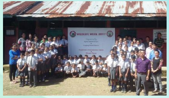
Figure 13: Participants from Government Schools at Nyengching, Longleng.

From 1st October 2017 to 7th October 2017, various competitions i.e. essay, painting etc. were organized in schools to create affinity for wildlife among students and children.