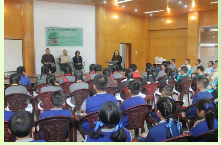
Figure 11: Department interacting with the young citizens at Kohima.

conservation and the role of students in conservation. Short videos on important wild animals and varieties of slides on wild life were presented during the program.