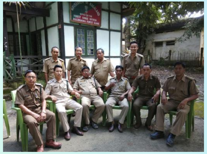
Figure 24: Naginimora Forest Range Office staff at the event

Wildlife Week was celebrated at Singhpan Wildlife Sanctuary in Mon on 8th Oct. 2017 at Namthai