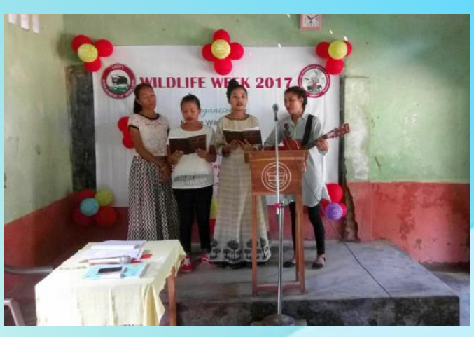
Figure 22: Teachers of United Higher Secondary School teachers

On 7th Oct 2017, the Department celebrated in United Christian Higher Secondary School (UCHSS) at Naginimora, Mon by conducting an essay competition for the school children on the topic "Conserving Wildlife for Future". Department discussed as to how conservation of wildlife is in the interests and benefit of humankind. How our creator has created all living beings and each living being as equally important. There performing a number at Naginimora, Mon