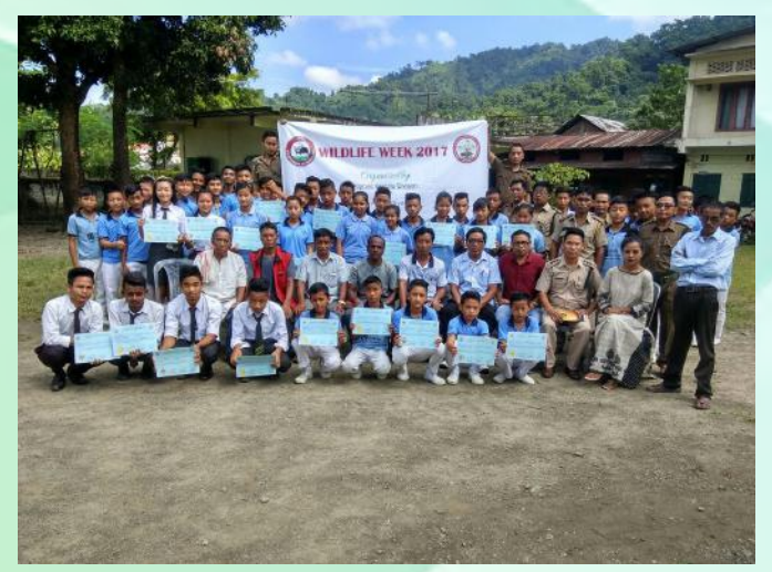
Figure 23: Participants with certificates at Naginimora, Mon

was also a special number by the UCHSS teachers. Around 300 participants attended the event.