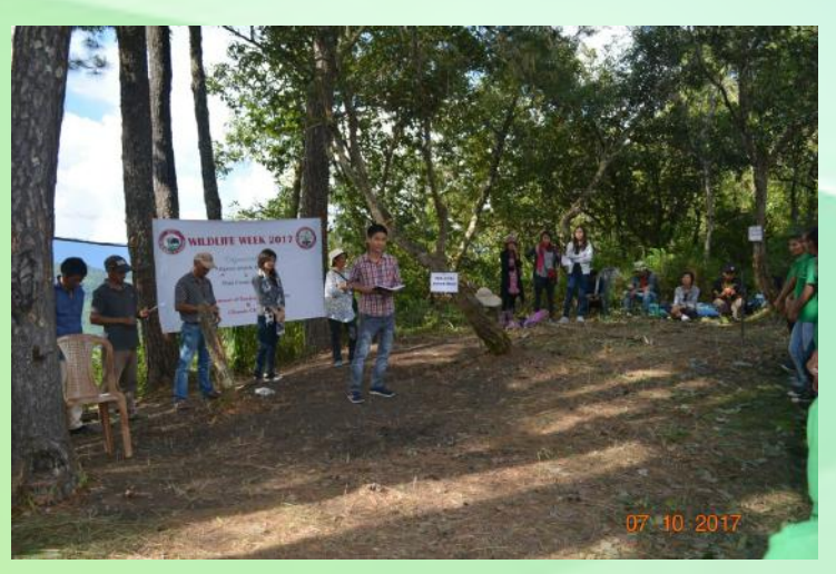
Figure 32: Conservation conversations at Krokropfii Community Conservation Area, Lephori, Phek