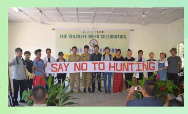
Figure 27: Important message being conveyed to the participants at Peren.

On the first day, 2nd Oct 2017, flex and banners were put up along the highways with messages of conservation. On 3rd Oct 2017, in solidarity with the national initiative towards "Swachhata Hi Seva" the department organized cleanliness drive in which important public spaces like Women Welfare Organization halls, campuses and public locations