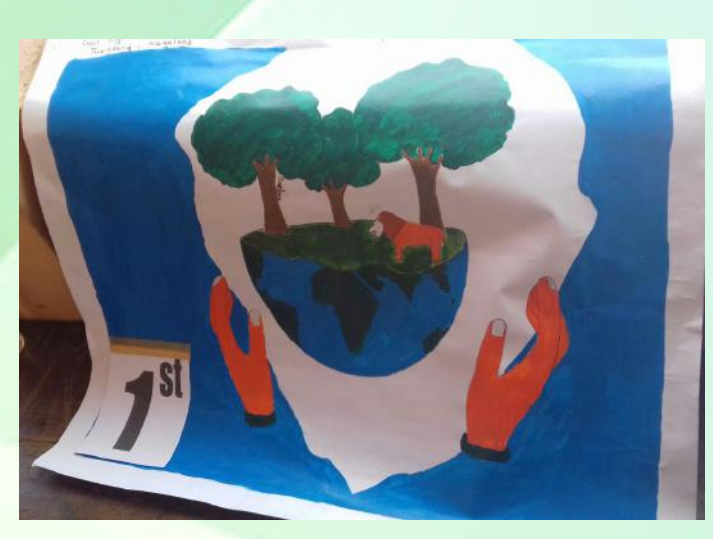
Figure 37: Winning paintings at Tuensang