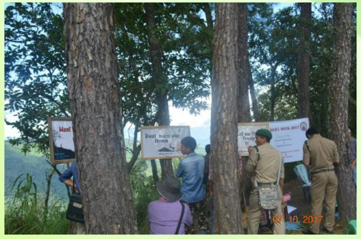
Figure 33: Conservation messages being displayed at Krokropfii Community Conservation Area, Lephori, Phek