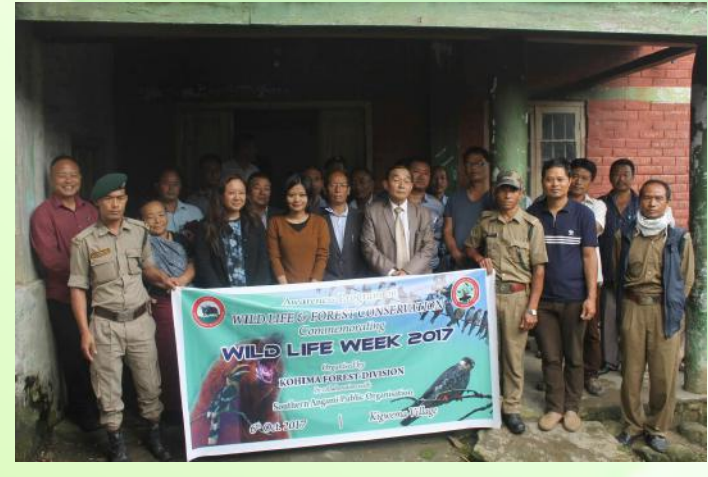
Figure 12: Awareness cum Community Consultation Program conducted at Kigwema village, Kohima.

vation were discussed. The program was attended by Department officials, SAPO officials, village councils, local functionaries of the villages, student unions, women society and church workers.