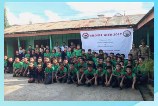
Figure 8: Participants at painting competition at El Beth High School, Kiphire Town.

vation". After the programme, the questions asked in the quiz were discussed and the participants were given a brief background of the different Acts and Regulations concerning wildlife in Nagaland and India. Contributions and efforts of Bhutan Glory Eco Clubin spreading the awareness of wildlife conservation was mentioned. Almost a 100 students participated in the event.