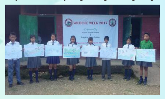
Figure 16: Winners of the painting competition at Longleng

On 7th October 2017, International wildlife week celebration was held at Yaongyimchen village in Longleng district, in combination with seminar on – Human and Animal conflict and 5 Years (2012-2017) Commemoration Program of Community Projects, launched under Lemsachenblak- A development society under Yaongyimchen, Alayoung and Sanglu. Shri Pankaj Figure 17: Participants at painting competition at Longleng Kumar, IAS, Chief Secretary, Government of Nagaland and the Chief Guest, appreciated the efforts of Yaongyimchem of converting hunters into conservationist and appealed to the Forest Department to extend financial and technical support to the villagers in their noble endeavor. Shri. Imkonglemba Ao, IAS Principal Secretary & Agriculture Production Commissioner and Chairman, Nagaland Bamboo Mission, Government of Na-