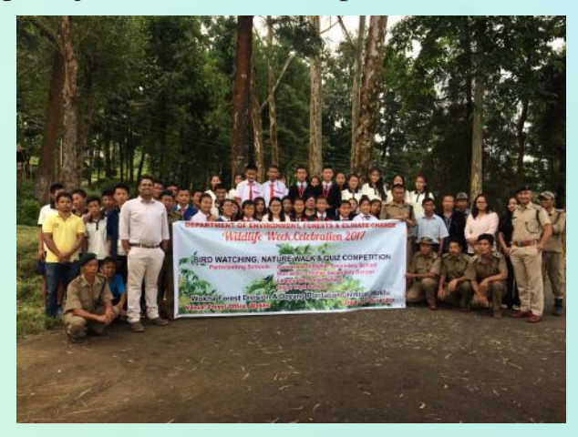
Figure 43: Participants of Bird Watching, nature walk and quiz competition at Wokha.

At the end of the program, the high-octane documentary "The Hunt" narrated by the much-acclaimed wildlife commentator Sir David Attenborough was screened. The film includes the story of the extremely tough journey of the migratory Amur Falcons at Doyang, Wokha, which covers an astonishing distance of about 22,000 km every year for their survival.