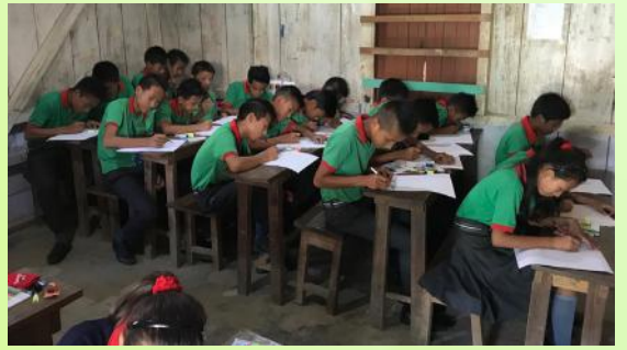
Figure 7: Students participating in painting competition at El Beth High School, Kiphire Town.

Nagaland in which any conservation initiatives from the Forest department cannot be implemented effectively without the community involvement was explained to the participants. Legal provisions in our Constitution and laws such as Wildlife Protection Act 1972 were discussed and highlighted - hunting or poaching of wildlife listed in the Schedules of the Act will result in not only in a hefty fine but also imprisonment of up to 7 years, depending on the wildlife species. Painting competition for the Government Primary Schools (GPS) saw good participation by the students. A total of 130 participants took part in the program.