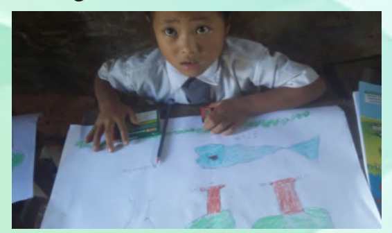
Figure 15: A little kid drawing on the theme of Environment with innocence.

Wildlife Week 2017 was celebrated by the Department on 6th Oct 2017 by Government Middle School Trongar 'A' Eco Club and Government Primary School Nyengching, Longleng.